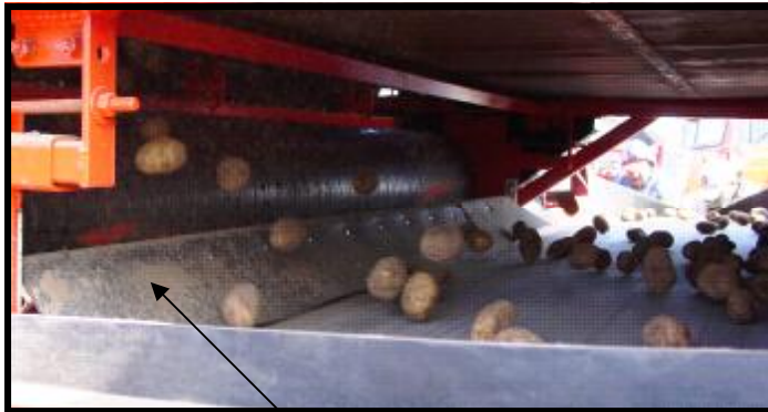
Flip Divider for Easy Cleaning