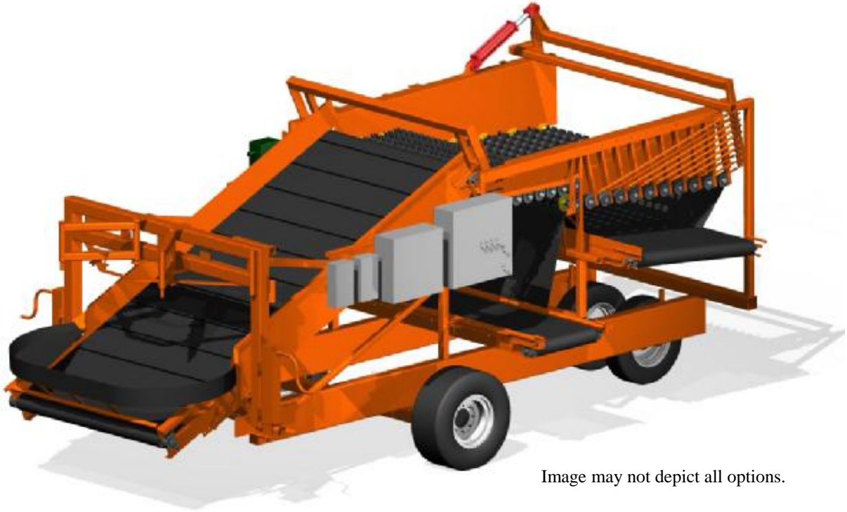
Image may not depict all options.