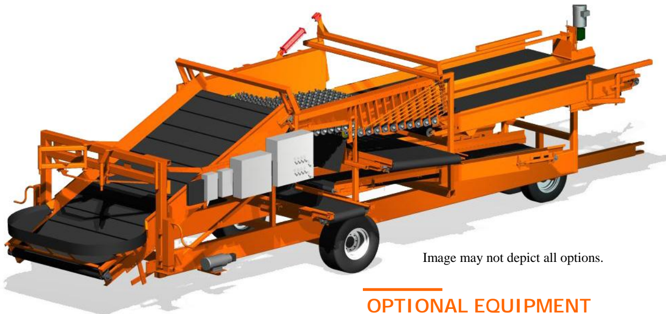
Image may not depict all options.