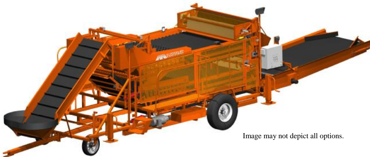
Image may not depict all options.