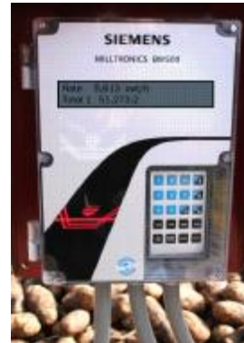
Digital Read-out (Displayed in cwt. or tons)