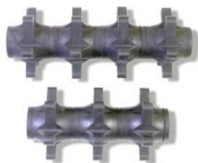
Dirt Eliminator Sizer Sorter Model MSDSE