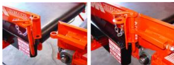
E-Z Connect Conveyor Coupling System