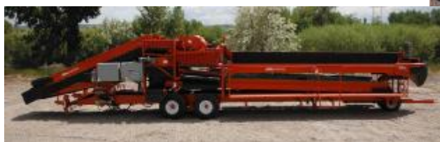
Dirt Eliminator Sizer Sorter Model MSDS