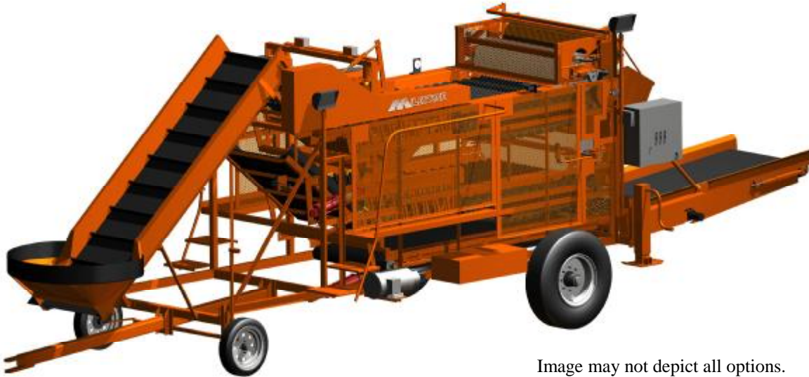
Image may not depict all options.